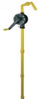
PPB - 1

Do not use with solvents, acetone, turpentine etc